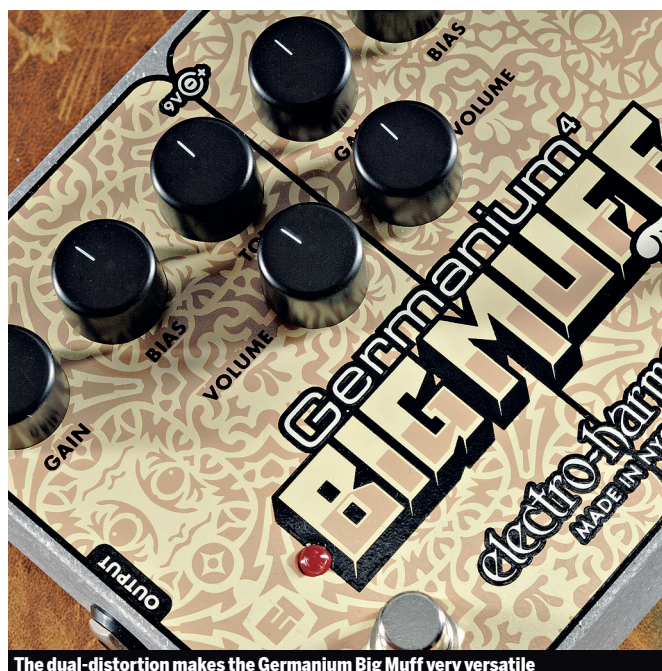
The dual-distortion makes the Germanium Big Muff very versatile

The distortion section is capable of much more dirt than the overdrive section and the two together pile it on further, creating plenty of sustain