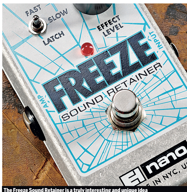
The Freeze Sound Retainer is a truly interesting and unique idea