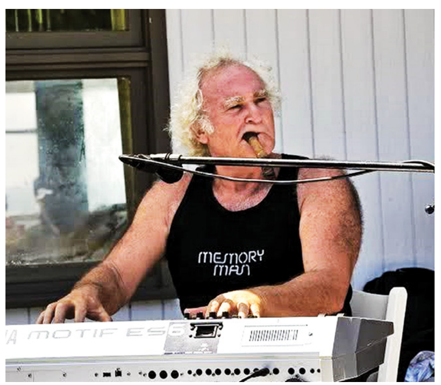
Matthews lends a funky piano groove to a recent jam.

Yeah, but it's hard to exactly pinpoint.